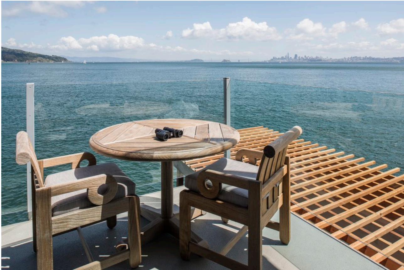
Gorgeous views from the deck of the second-floor Vista Suite ($1,555 per night).

// The Inn Above Tide, 30 El Portal (Sausalito); rooms starting at $415 for a double can be reserved at innabovetide.com