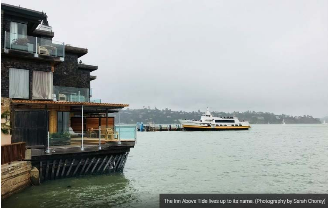
The Inn Above Tide lives up to its name.