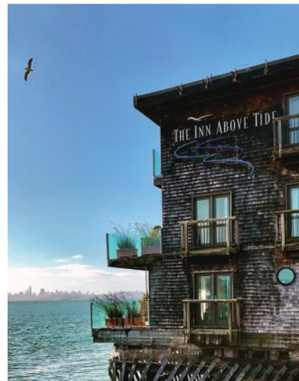
Panoramic San Francisco Bay views are the signature of The Inn Above Tide. This intimate Sausalito waterfront hotel with 33 rooms and suites is a magnificent location for a uniquely inspiring luxury retreat.

Only a 30-minute drive from San Francisco, and an hours drive from the Silicon Valley, the family-owned inn is an oasis with 33 guest rooms, including three new modern suites outfitted with fireplaces, soaking tubs, seaside patios, and one with a full kitchen. For the spacious remodeled suites (worth the splurge!), the design team of Antonio Martins of A/M Interior Design opted for luxurious wall coverings and warm earth-tone furnishings, mixed with the cool blues of the bay reflected just outside the windows. ➔