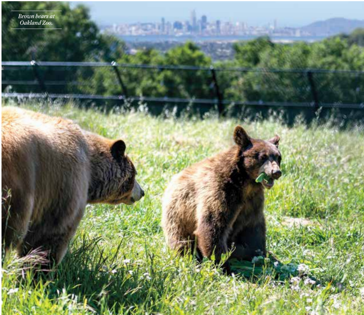
Brown bears at Oakland Zoo.

SEPTEMBER 2018 // A GUIDE TO WHAT'S HAPPENING NOW IN YOUR AREA