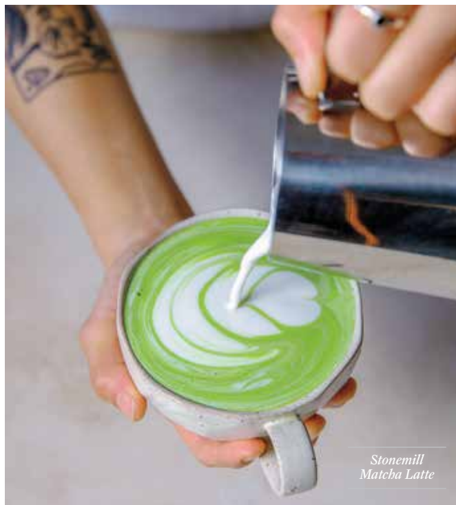
Stonemill Matcha Latte

DO / Migration is top of mind these days, but long before it became the stuff of daily news headlines, movement and transnational identity were front and center for Korean artist Do Ho Suh. That's what makes his exhibit The Spaces in Between at the Iris & B. Gerald Cantor Center for Visual Arts at Stanford University feel so prescient. Known for large-scale sculptures and installations, the artist puts his personal journey on display in three complementary pieces. The wallpaper-like Who Am We? uses miniature portraits from Suh's high school yearbooks to evoke a migrant's feeling of estrangement from his