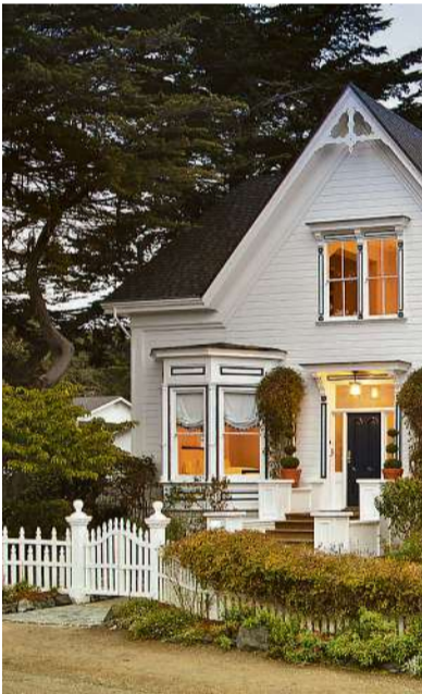
Left: Sutter Creek offers many different antique stores with a variety of gifts. Right: The five-room Blue Door Inn is a charming historic property.

to include eight more locations in Sonoma, Napa and Marin counties. Besides thousands of books, the light-filled Healdsburg store also includes a cornucopia of greeting cards, magazines, puzzles and (though not for sale) a friendly cat or two.