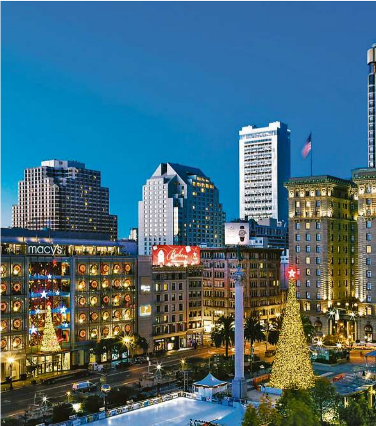
The Westin St. Francis is convenient for guests to enjoy the 30,000 light Christmas tree, skating on the seasonal ice rink and shopping at Macy’s.