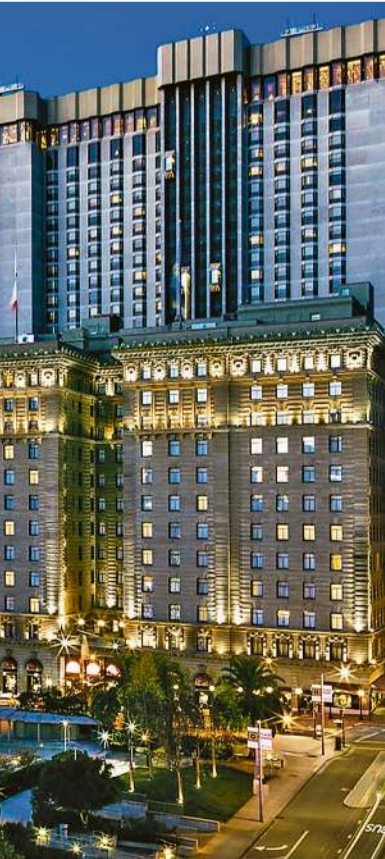
WESTIN ST. FRANCIS

ard Street, the most chic of the properties, while the six-room Packard House on Little Lake Street is the most affordable; rates at the JD House on Ukiah Street, whose eight rooms include a converted water tower, tend to lie in between.